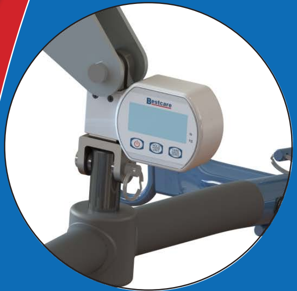
PL500 Shown with DSC700