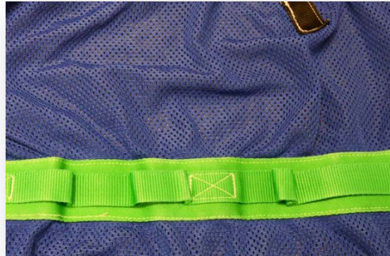
Back strap with Permanent Crease