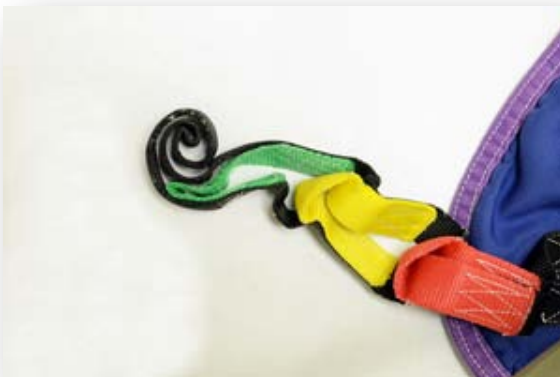
Extreme Loop Strap Curling

Extreme Curling / Permanent Wrinkles of loop straps can set in when the slings are dried at high heat or dried over an extended period of time. Heat combined with bleach or other chemicals will intensify the chemical action.