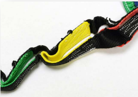
Loop Strap with Excessive Edge Abrasion

Strap Brittleness / Stiffness / Surface and Edge Abrasion are additional indicators that the sling may have been laundered in unsuitable conditions and has lost tensile strength. Loop straps that have stiffened or become brittle will tend to remain in the state, position, or shape it is bent into instead of returning into a normal relaxed state.