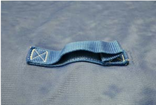
Handle with Permanent Crease

In addition to the loop straps, the back strap and sling handles if present will also show the permanent creases. Permanent creases will tend towards its original wrinkled position even when stretched out.