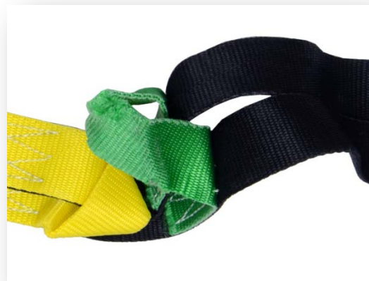
Stiffened and Brittle Loop Strap

Permanent crease, wrinkles along with brittleness increase the chance that the fabric will suffer more damage from abrasion, internal fiber abrasion as well as external abrasion with other objects. Wash cycles with excessive agitation will increase abrasion and degradation of the fabric.